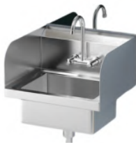
HAND WASH SINK