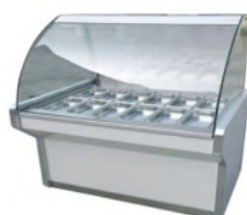
HOT DISPLAY BAIN MARIE