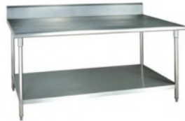
WORK TABLE WITH SPLASH