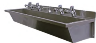
HAND WASH SINK 4 TAP