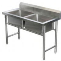
2 SINK UNIT