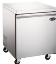
SINGLE DOOR CHILLER