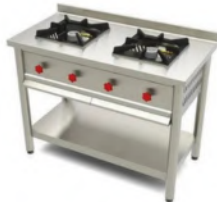
2 BURNER COOKING RANGE