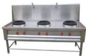
3 BURNER COOKING RANG