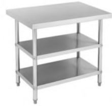
WORK TABLE WITH 2 US