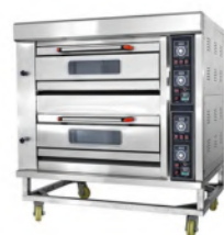
2 DECK OVEN