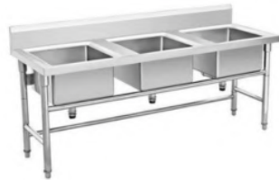
3 SINK UNIT