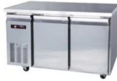
2 DOOR MAKE LINE CHILLER