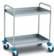
DISH-COLLECTING TROLLEY COPY