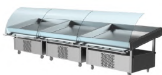
FISH DISPLAY COUNTER