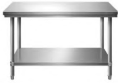
WORK TABLE WITH 1 UNDERSHELF