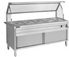
BAIN MARIE WITH CANOPY