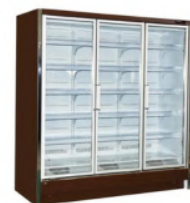
SUPER MARKET CHILLERS