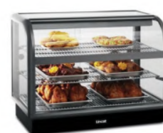
HOT DISPLAY COUNTER