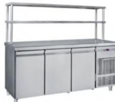
UNDER COUNTER WITH OHS