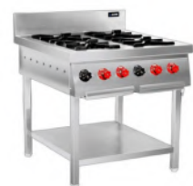
4 BURNER COOKING RANGE