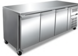
UNDER COUNTER WITH OHS