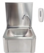
KNEE OPERATED HAND WASH