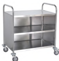
3 TIER TROLLEY