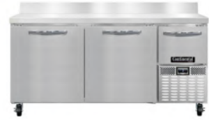
2 DOOR UNDER COUNTER CHILLER