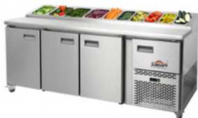
COLD BAIN MARIE