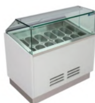
ICE CREAM DISPLAY COUNTER