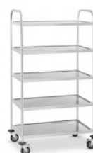
4 TIER TROLLEYS