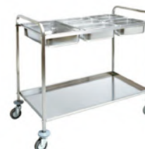
TROLLEY WITH GN PAN