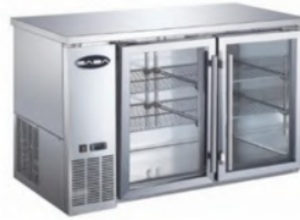
BACK BAR CHILLER