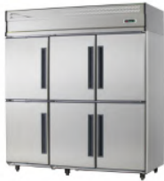
6 DOOR UPRIGHT CHILLER