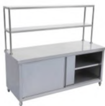
PICK-UP COUNTER WITH CABINET