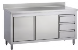
WORK TABLE WITH CABINETS