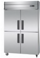
4 DOOR UPRIGHT CHILLER