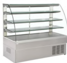
CURVED DISPLAY COUNTER