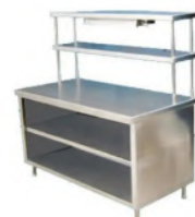
PICK UP COUNTER WITH FOOD WARMER