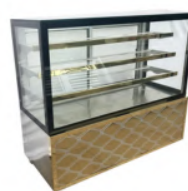
SANCKS DISPLAY COUNTER