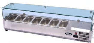
TABLE TOP SALAD BAR