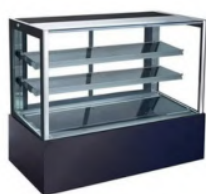
CAKE DISPLAY COUNTER