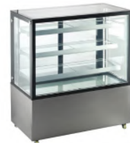
PASTRY COOLER STRIGHT GLASS