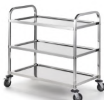
3 TIER TROLLEY