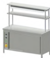
HOT CABINET WITH PICK UP COUNTER