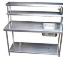
WORKTABLE WITH SINK