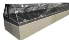
FISH DISPLAY CHILLERS