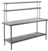
WORK TABLE WITH 2 OHS