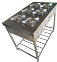
APPAM COOKING RANGE