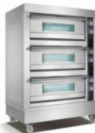
3 DECK OVEN