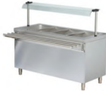
BAIN-MARIE WITH SNEEZE GUARD