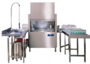
CONVEYOR TYPE DISH WASHER